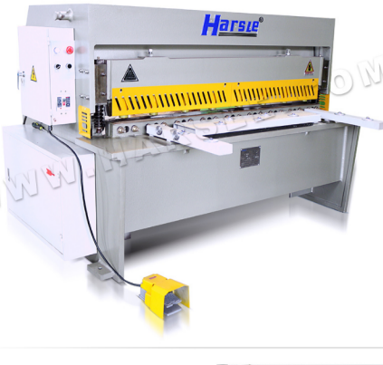
No. 1 Control Panel