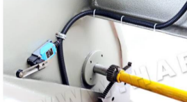
No. 8 Limit Switch