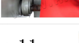
No. 11 Emergency Button