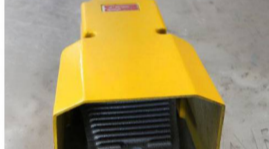
No. 4 Foot Switch